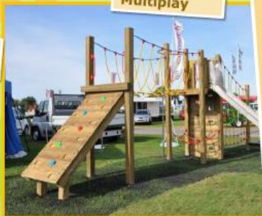
Celtic Ranch Multiplay